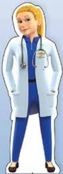
Counter Cardboard Standup